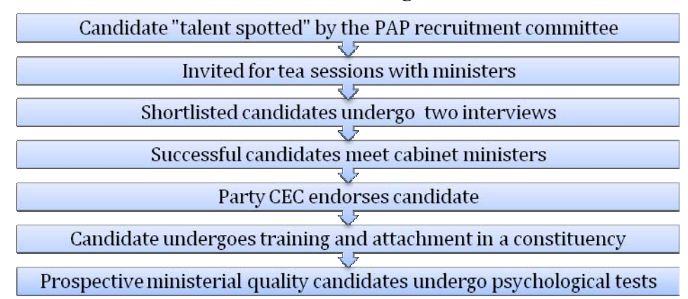
Chart 1: Candidate Selection Process of a PAP Legislative Candidate

Stage 6: Selected candidates who have been deemed to have ministerial quality will be asked to go through an additional stage of psychological tests of over one thousand questions that lasts around one-and-a-half days (Mauzy and Milne 2002, 49). At this stage, the PAP adopts the system of potential appraisal system developed by Shell oil company to assess the personality and disposition of its candidates. The psychological tests focus on identifying four basis qualities, denoted by the acronym HAIR: 1) "helicopter quality" (an individual's ability to examine a problem from a higher vantage point while simultaneously being able to zoom in on the details); 2) "power of analysis" (ability to rationally and rigorously analyze issues, 3) "imagination" (creativity to develop fresh approaches to a problem) and "sense of reality" (ability to integrate vision and imagination with realities on the ground) (Neo and Chen 2007, 351). In each election, five to six candidates are identified to have ministerial qualities and carefully groomed for higher office. The elaborate candidate selection process is summarized in a flow chart 1 below.