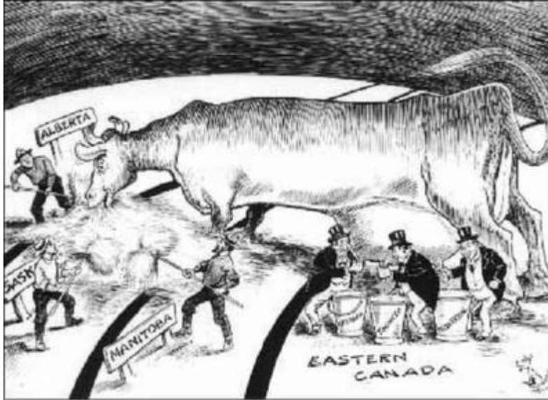
The Milch Cow, a cartoon first published in the December 15, 1915, edition of the Grain Growers Guide. Pails are labeled Manitoba, Saskatchewan, and Alberta.